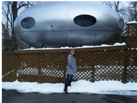
Posted by Lyinn at 8:50 PM